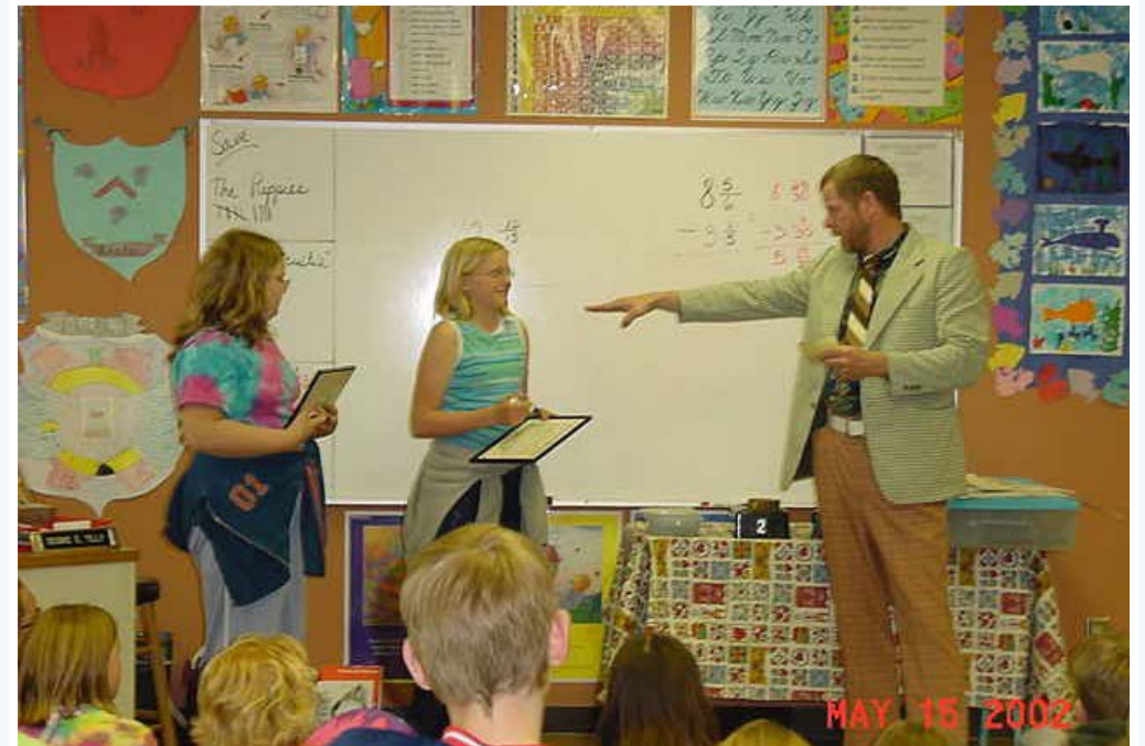
Older students love the fast pace, action packed Game Show, with their chance to win "Conservation Bucks!"